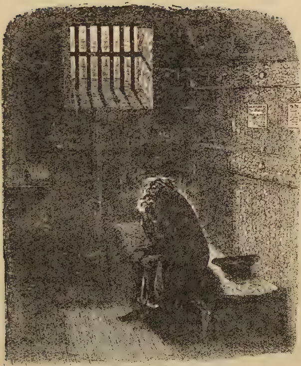
FAGIN IN THE CONDEMNED CELL.